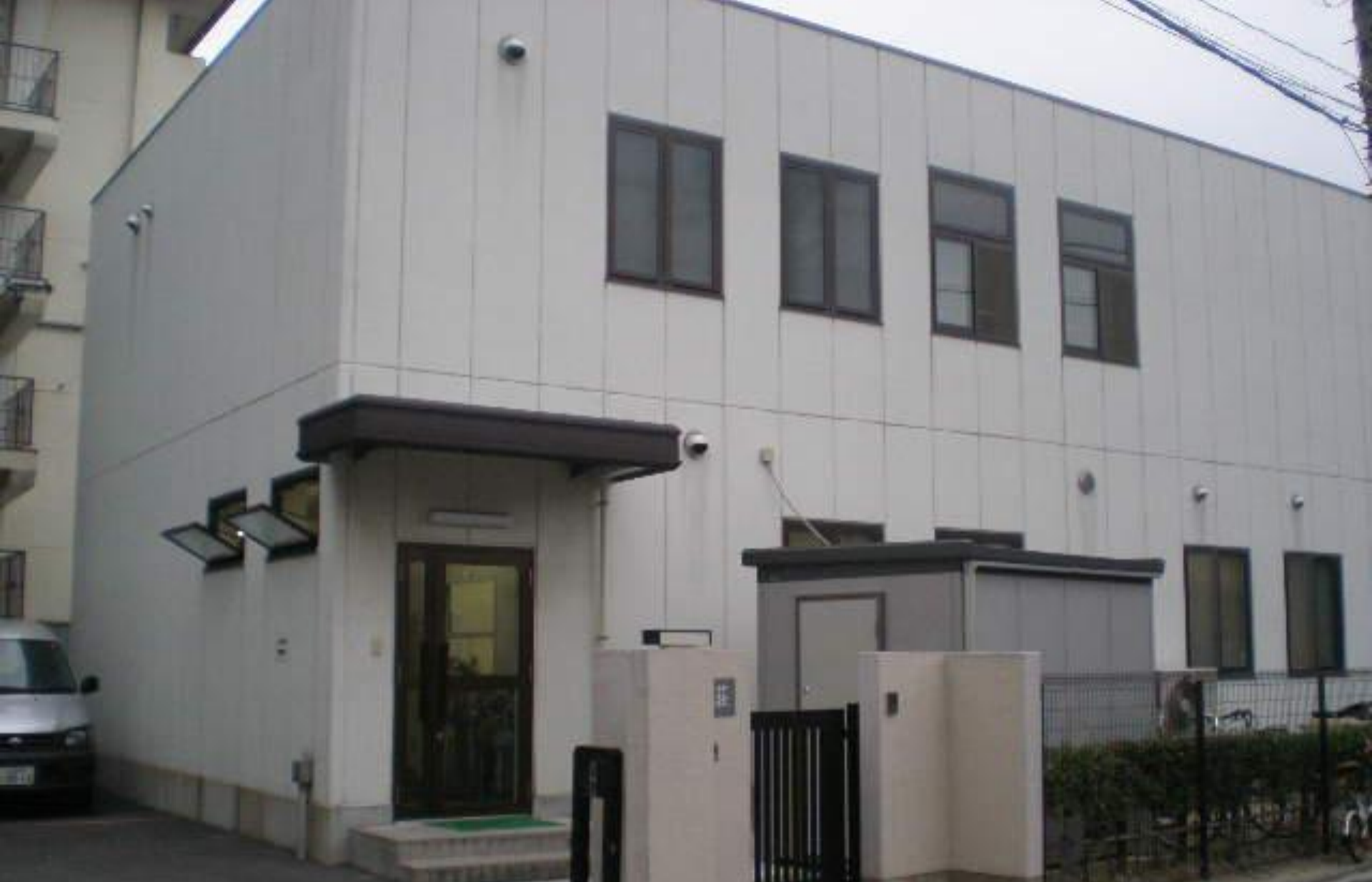
Atsuta Self-reliance Support Center (Nagoya)