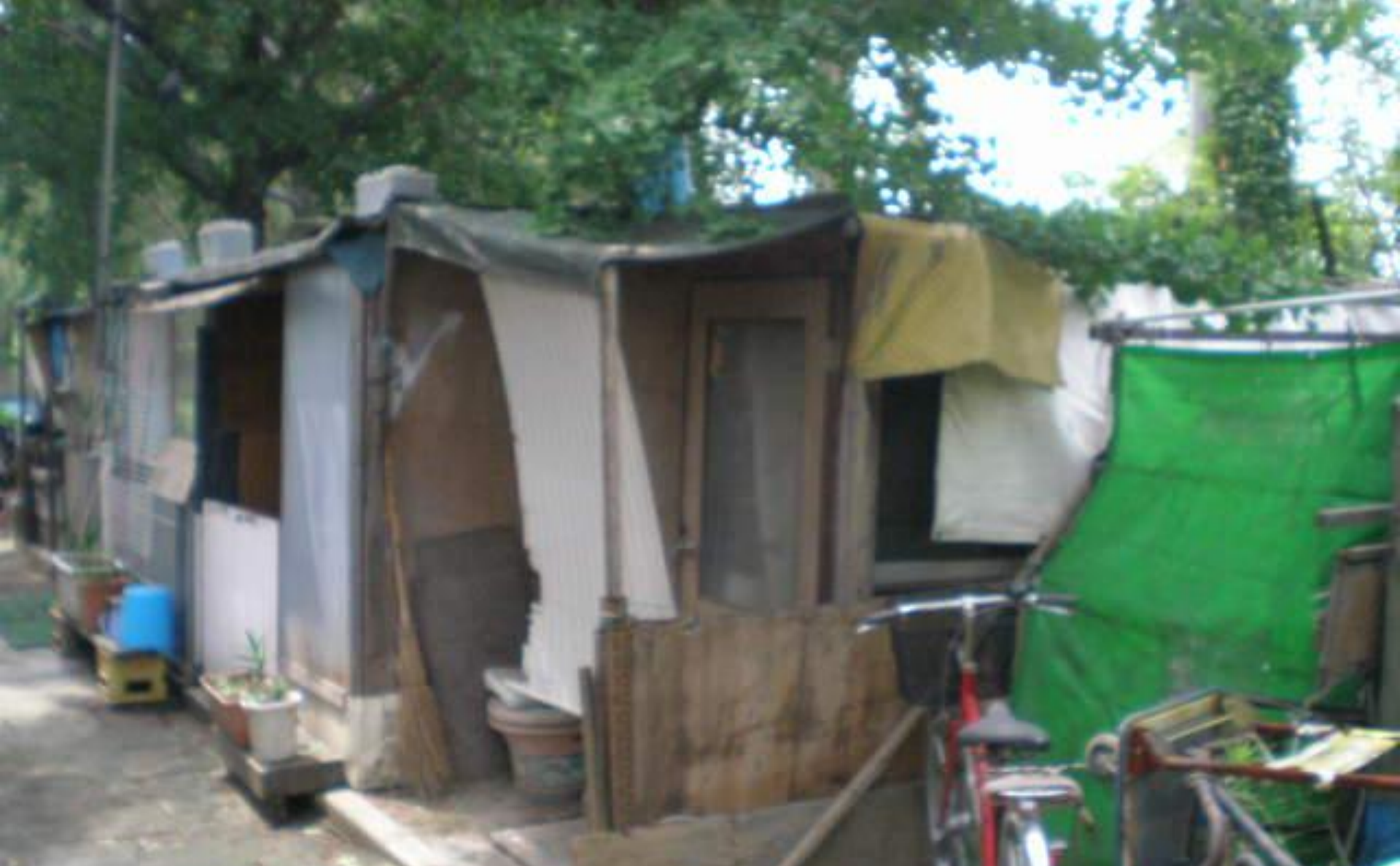
Nishinari Park, Osaka