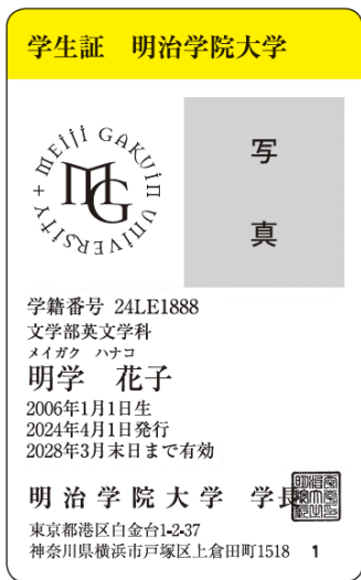
Student ID front

Your student ID serves as proof that you are a student of Meiji Gakuin University. Always bring it with you when you come to school, and please have it available to show any time you are asked to do so by faculty members or other university staff. The student ID is an IC card.